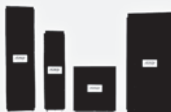
CC3060 CC2060 CC3260 CC6360