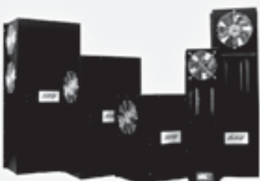
CC2500F CC1300F CC900F CC400F CC600F